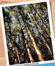
~Saryeoni Healing Forest

The week's retreat includes opportunities to take in the natural beauty of Jeju. Comprising UNESCO Heritage sites – Hallasan Mountain Natural Reserve and rejuvenating walks through the famed 'healing forests' and Seongsan Ilchulbong Tuff Cone, with majestic views of the Jeju Straits, amongst other magnificent sites. Jeju offers the ideal location to experience beauty, explore wonder, and consider possibilities – both internally and externally.