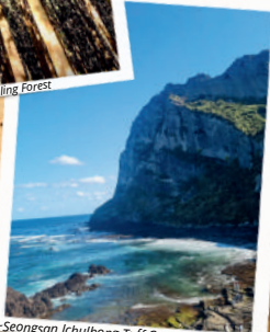
~Seongsan Ilchulbong Tuff Cone

"It's not down on any map, true places never are."